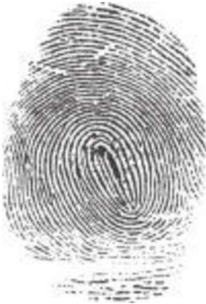
Fingerprint #2 (found on cash register)