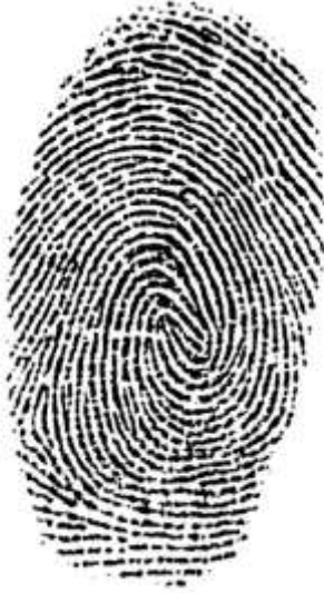
Fingerprint 1 (found on doorknob)