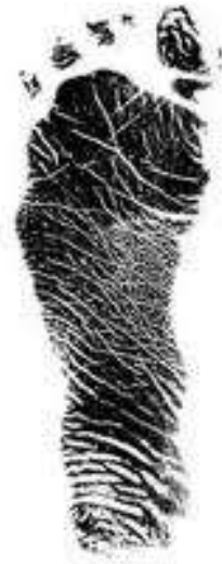
Footprint 1 (found near entrance)